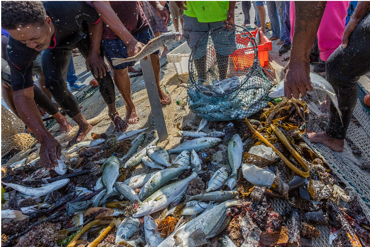
Figure 1. Fishers sorting and measuring the catch of a beach-seine in False Bay, South Africa. Undersized fish are collected in a hoop-net for immediate release. Of 170 permits for such operations in the 1970s, only 4 remain today. Methods such as LBB can help in estimating the stock status of the four main species and in determining minimum landing sizes that reduce the impact of fishing on these stocks.

The reformed Common Fisheries Policy of the EU and similar legislation around the world require all exploited fish stocks to be managed such that they are larger than the size required to produce maximum sustainable yields (MSY). However, the data needed for full stock assessments are available for only a subset of the exploited stocks (Figure 1). This has renewed interest in simpler methods to approximate stock size from limited data, such as productivity derived from life history traits combined with time series of catch or length composition data combined with best available approximations of natural mortality and fecundity.