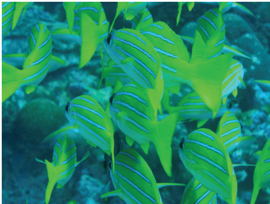
Figure 2 | Bluestriped snapper, Lutjanus casmira , is a typical reef fish photographed here on Christmas Island in the central Pacific Ocean.

were run centrally. The same holds for census projects in different contexts, from the Domesday Book, a census of land, livestock and possessions in eleventh-century England ordered by William the Conqueror, to the US census, run by the US Census Bureau. Attempting a population census bottom-up would probably yield something like the number of jazz musicians in New Orleans, lumberjacks in Oregon and financial analysts in New York City, but no countrywide population estimate.